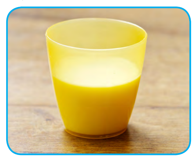
Cup containing 100ml or 3oz of milk.

Whole (full fat) cows' milk should not be given as a drink to infants under a year<sup>1</sup>. From 12 months toddlers can have whole milk as their milk drink. It contains very little iron and should be limited to a maximum of three drinks of 100-120ml per day, or less if toddlers are eating cheese and yogurt (which also provide calcium but are low in iron).