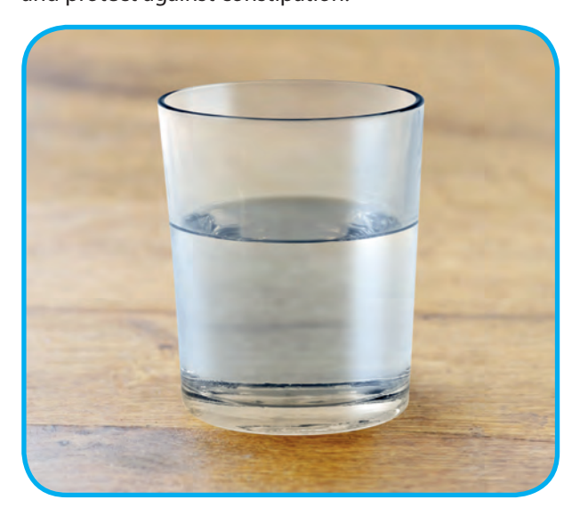
Glass containing 100ml or 3oz of water.

Fluids are an essential component of the diet to maintain hydration. They aid digestion and absorption and protect against constipation.