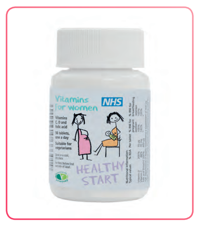
Healthy Start vitamins for women

Supplements providing these two nutrients are also shown in Table 3.