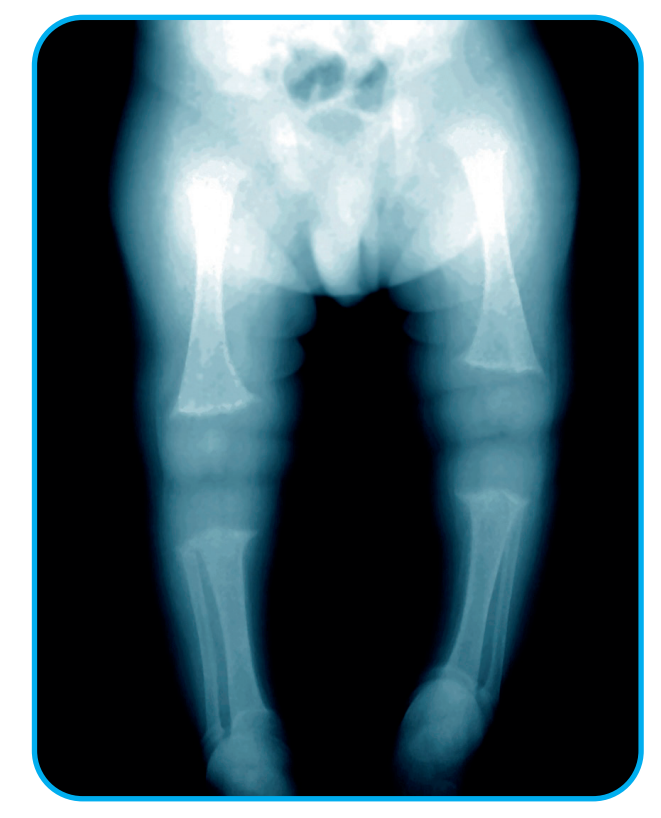
An X-ray of the legs of a young child with rickets caused by vitamin D deficiency.

Low levels of vitamin D during pregnancy is associated with a higher risk of severe pre-eclampsia<sup>9,10</sup> and infants born with low birth weight (LBW) and small for gestational age (SGA).<sup>11</sup> Evidence is emerging of a link between sudden infant death syndrome (SIDS) and low vitamin D levels.<sup>12</sup>