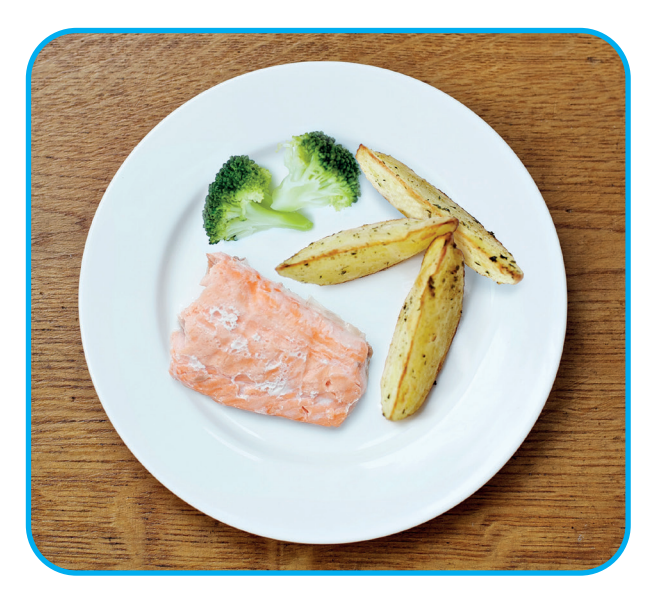
Oily fish (salmon). Portion appropriate for 1–4 year olds. See Factsheet 1.3

Very few foods naturally contain vitamin D. Oily fish is the only significant source. Eggs and meat provide very small amounts. Breast milk provides extremely small amounts.